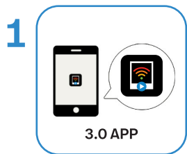
1 Download the Polaroid Wi-Fi Photo Frame 3.0 app on an Android/iOS smartphone or iPad