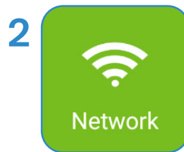
2 Connect frame to a Wi-Fi network Wi-Fi router with a 2.4GHz internet connection required