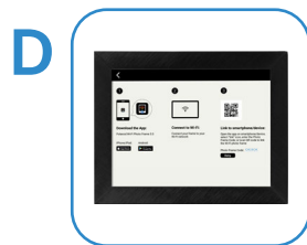
Follow the prompts on the start screen

When the frame powers on the Polaroid logo will flash twice on the screen while system initializes.