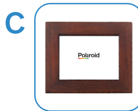
Frame powers on automatically when first plugged in

When the frame powers on the Polaroid logo will flash twice on the screen while system initializes.