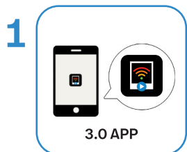
1 Download the Polaroid Wi-Fi Photo Frame 3.0 app on an Android/iOS smartphone or iPad