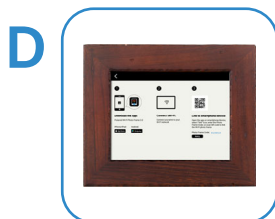
Follow the prompts on the start screen

When the frame powers on the Polaroid logo will flash twice on the screen while system initializes.