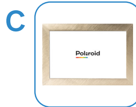
Frame powers on automatically when first plugged in

When the frame powers on the Polaroid logo will flash twice on the screen while system initializes.