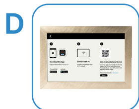
Follow the prompts on the start screen

When the frame powers on the Polaroid logo will flash twice on the screen while system initializes.