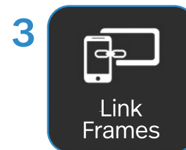
3 Link frame to Android/iOS smartphone or iPad Select Link Frames in the app and enter the secure 8-digit Photo Frame Code or scan QR code to quickly link the Wi-Fi photo frame.