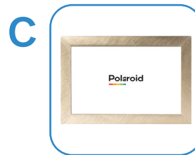
Frame powers on automatically when first plugged in

When the frame powers on the Polaroid logo will flash twice on the screen while system initializes.