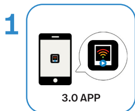
1 Download the Polaroid Wi-Fi Photo Frame 3.0 app on an Android/iOS smartphone or iPad