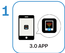
1 Download the Polaroid Wi-Fi Photo Frame 3.0 app on an Android/iOS smartphone or iPad