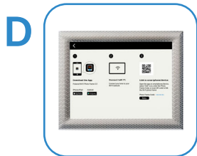
Follow the prompts on the start screen

When the frame powers on the Polaroid logo will flash twice on the screen while system initializes.