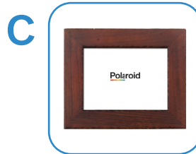
Frame powers on automatically when first plugged in

When the frame powers on the Polaroid logo will flash twice on the screen while system initializes.