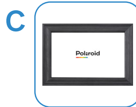
Frame powers on automatically when first plugged in

When the frame powers on the Polaroid logo will flash twice on the screen while system initializes.